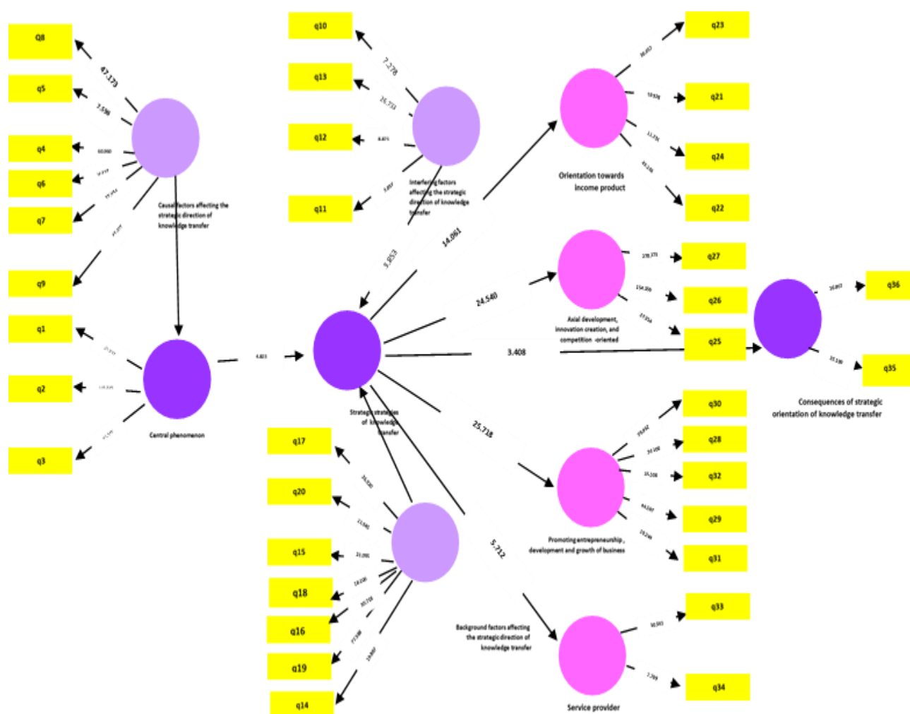
Figure 1. The strategic orientation model of knowledge transfer in applied scientific comprehensive university in T-statistics mode

According to the second and third order factor loadings, the model of strategic orientation of knowledge transfer in University of Applied Sciences and Technology was presented in the T-statistic mode in Figure 1 and in the factor loading mode in Figure 2.